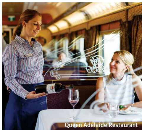
Queen Adelaide Restaurant